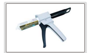
glue gun and glue (included)