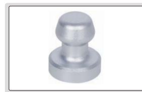
Ø20mm dolly (included)