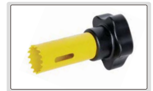
cutting tool (included) for Ø10mm, Ø14mm, Ø20mm dolly